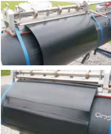
CSC-X Field Bonder