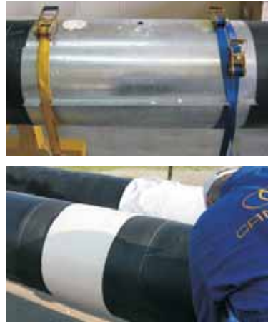
CSC-X Molded Foam