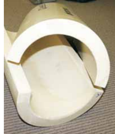
CSC-X Foam Half-Shells